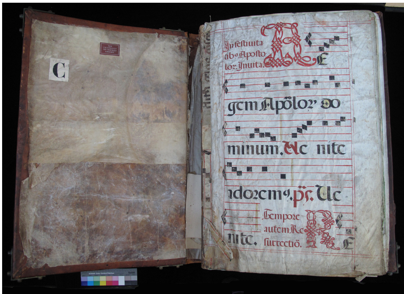
Fig. 2. Before treatment

spine. The old cords were removed from the channels and holes, and lifted off the board where adhered.