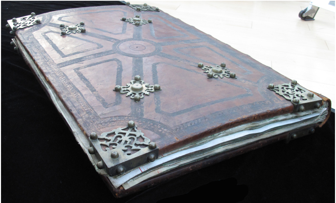
Fig. 1. Before treatment

exacerbating the poor condition of the book. The book was prioritized for conservation because the Special Collections Research Center curators did not want to limit its use or risk further damage from handling.