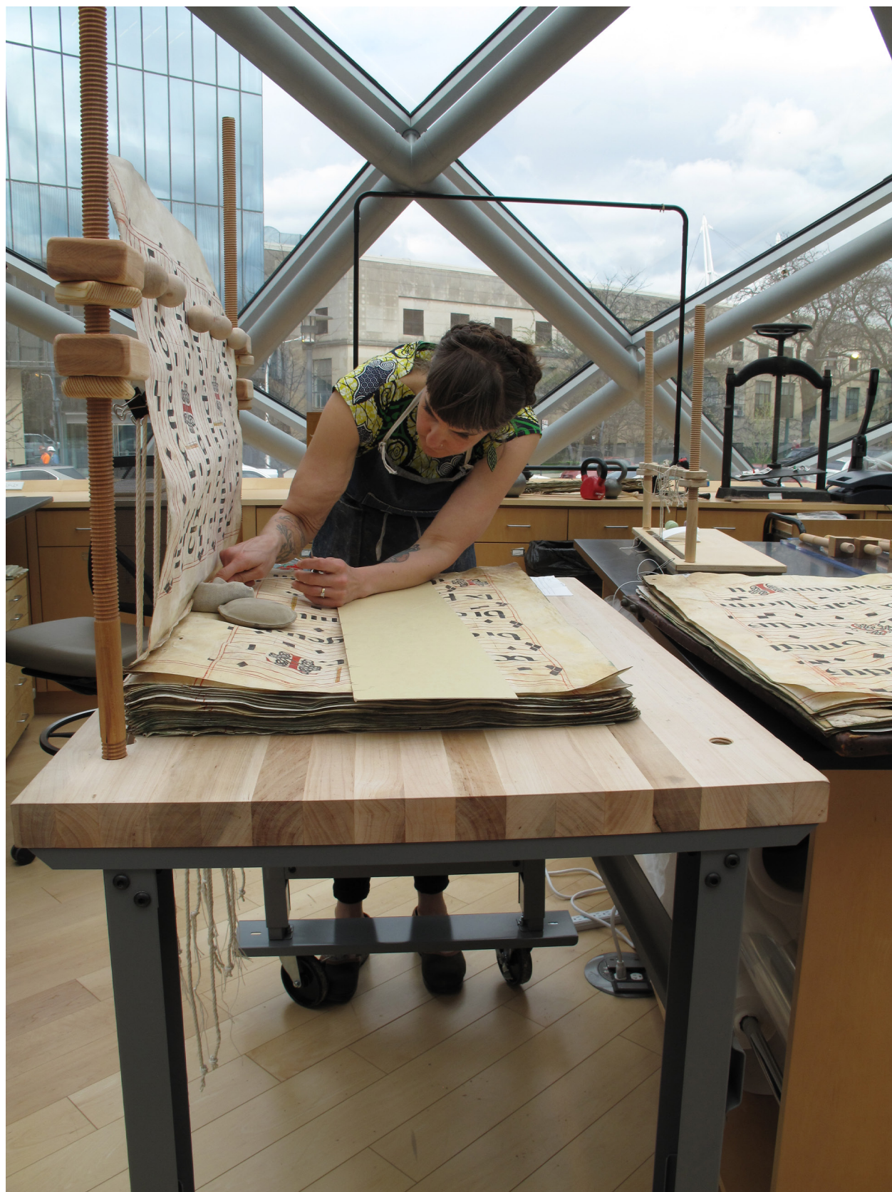
Fig. 4. Using the oversized sewing frame