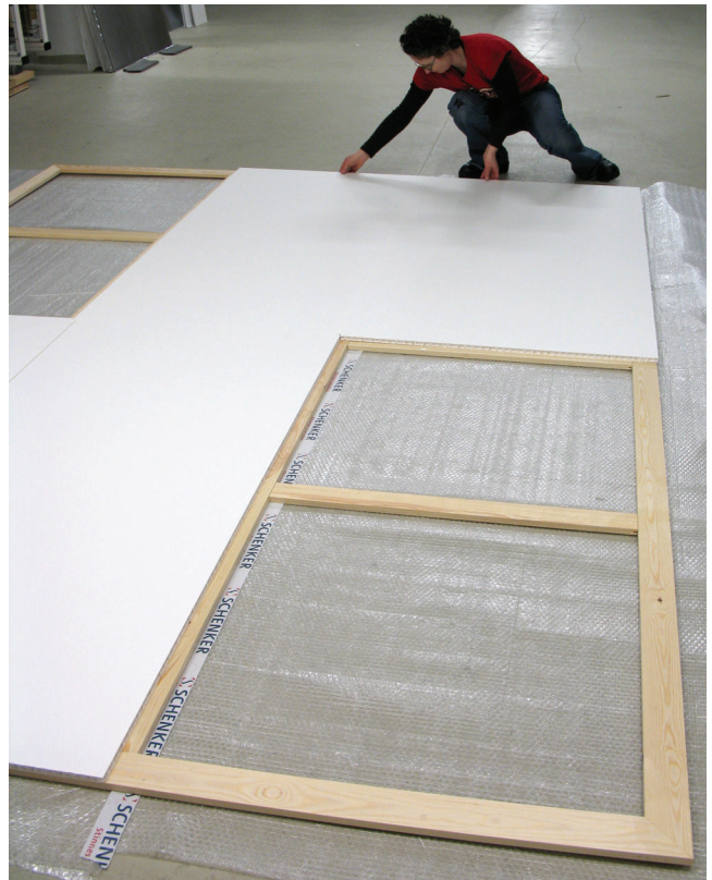
Fig. 5. Constructing mount of paper honeycomb panels glued to a wooden lattice.

The creases were lightly wetted with deionized water applied with a fine brush and then quickly weighted between smooth mat boards. The tears were repaired with sekishu shi Japanese paper (31 gm 2 ) and BEVA film applied with a heated spatula through silicon-coated polyester film (fig. 7). To readhere the lifting tape, BEVA film was inserted between the tape carrier and the paper surface.