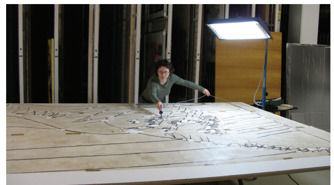
Fig. 7. Applying BEVA and Japanese paper repairs with heated spatula.