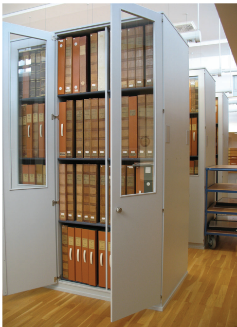
Fig. 1. Mounted drawings are housed in Solander boxes, stored upright in locking cabinets

large shared tables in the center. In the laboratory for wet treatment, sinks line the back wall, there is a large suction table, humidity chamber, fume hood, and elephant trunk extraction system. For a recent grant-funded project, the lab had a photographic copy stand custom-made by Manfred Meyer, a conservator and engineer who furnished the lab at the Albertina Museum in Vienna (fig. 3). The artwork to be photographed lies on a velvet-covered slant board with a ledge at the bottom. A digital camera is mounted on an angle so one can comfortably see the view screen and the camera cannot fall on the artwork. It is held in a fixed position, parallel to the slant board, and moves up and down the angled bar. The light fixtures are mount-