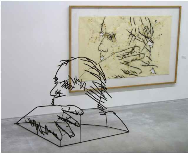
Fig. 4. Installation view of Self Portrait , 1992, unpainted rebar and black marker on cream wove paper with burnt holes. Collection Berlinische Galerie.

ally mounts the pieces by stapling them to a white, rigid support and then frames them with Plexiglas.