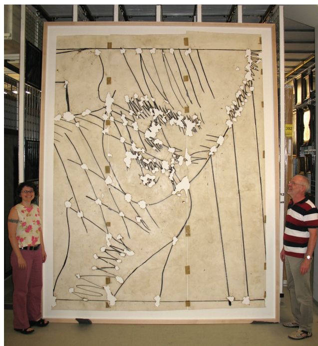
Fig. 9. Frank Dornseif's Self Portrait in Nepal , 1987, after treatment and mounting. Black marker, yellow oil stick, studio dirt, and packing tape on tracing paper with burnt holes, 3.23 x 2.48 m. Collection Kupferstichkabinett-Berlin (LB 68-1992).