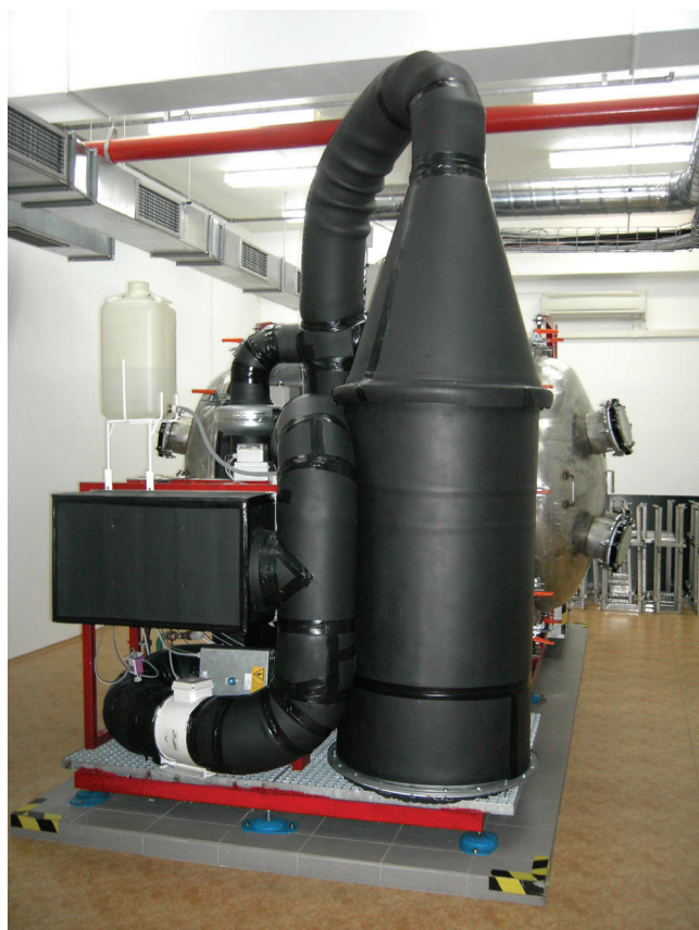
Fig. 1. The multifunctional vacuum chamber (view from the front side)

This system collects the waste water into a special glass container.