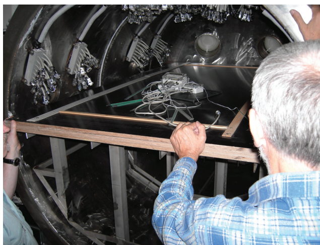
Fig. 6. Preparing the chamber for the drying of large-format documents

In the next phase, we would like to further exploit the chamber's properties. The combination of nitrogen, a vac-