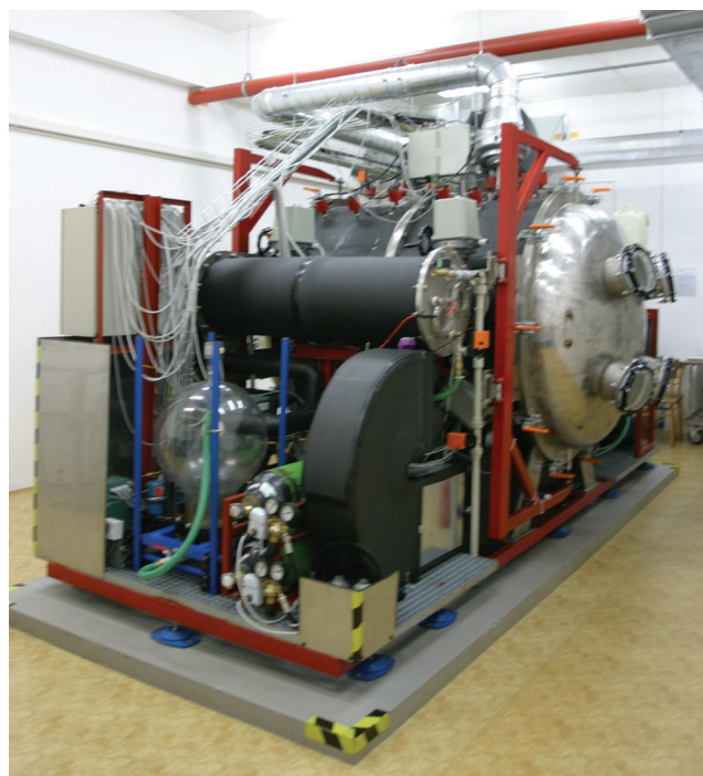
Fig. 2. The multifunctional vacuum chamber (view from the opposite side)

Good drying results depend on the accuracy of the drying parameters—above all on pressure, temperature, and relative humidity. We decided therefore to construct an additional, independent measuring system based on the usage of special sensors in a control (“signal”) book and in several other places inside the chamber, as well as a tensiometer for recognizing weight (water) loss. Data obtained from this system are accessible on the control PC and by internet transmission to dedicated remote PCs of key personnel. We monitor the humidity of the books after drying manu-