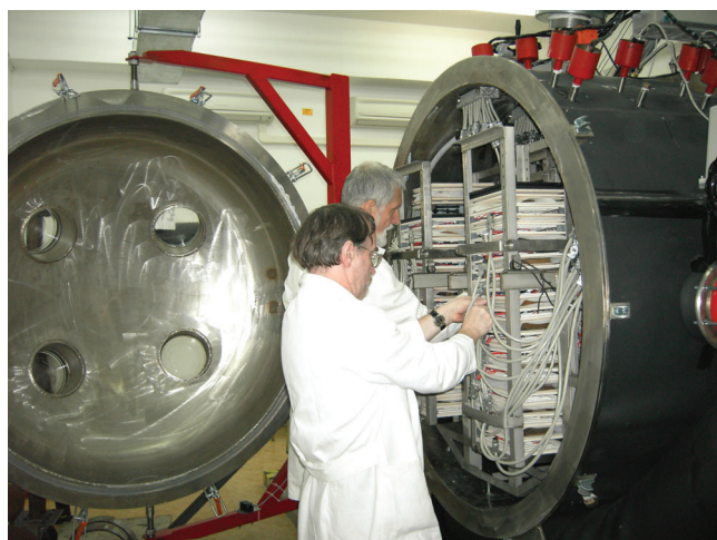
Fig. 3. Connecting cables to the heating tiles